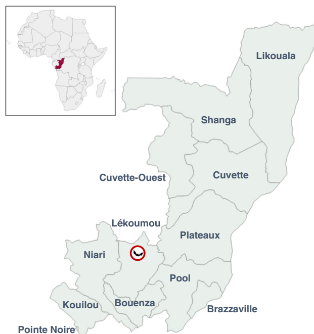
Figure 1. Map of the Republic of the Congo highlighting the area where sampling took place.

One group of animals that exhibits high species richness and global distribution are bats, and multiple bat species have been identified or proposed as the source or reservoir for emerging infectious diseases including high impact zoonoses such as Rabies, Ebola and SARS (Calisher 2015; Calisher et al. 2006; Maganga et al. 2014). While it is debated whether or not bats actually host disproportionately many (zoonotic) viruses compared to other groups of animals, or if our data is leaning towards that conclusion due to a systematic sampling error, there is little doubt about their importance in that role (Guy et al. 2019; Luis et al. 2013; Olival et al. 2017; Mollentze and Streicker 2020). A handful of orbiviruses has been detected in bats in several Asian and African countries, with sequences available for Japanaut virus (Papua New Guinea), Heramatsu orbivirus (Japan), Ife virus (Nigeria), Fomede virus (Guinea), and Bukakata orbivirus (Uganda) (Fagre and Kading 2019; Fagre et al. 2019; Kemp et al. 1988; Miura and Kitaoka 1977; Schnagl and Holmes 1975; Zhao et al. 2013). Considering the role of bats as virus reservoirs and the role of orbiviruses as pathogens we were interested in the potential presence of orbiviruses in bats living in the Congo Basin. We consequently set out to test bat samples for the presence of orbivirus RNA.